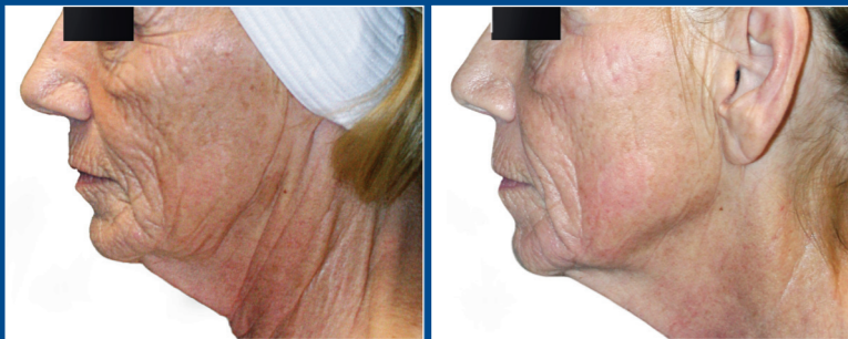
Results after 7 treatments.