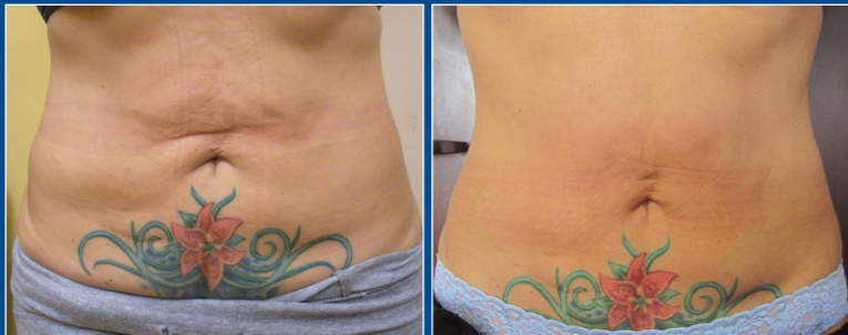
Results after 3 treatments.