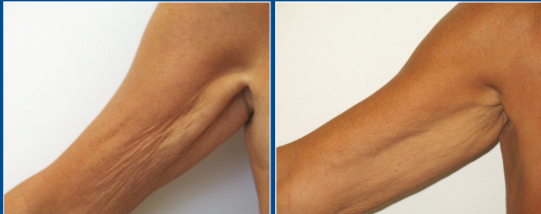
Results after 6 treatments.